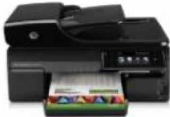
MULTI FUNCTION PRINTER